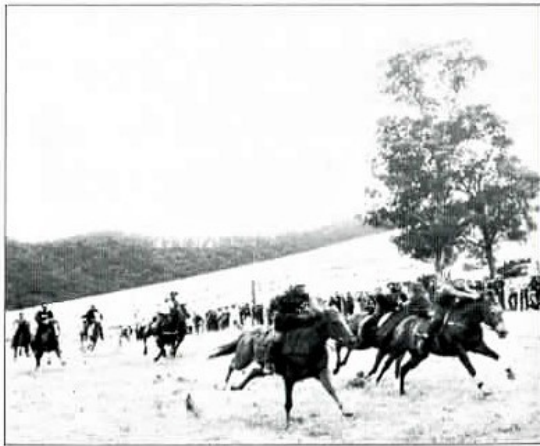
Stockman's Dash at Castleburn

But just as the crowd all rose to cheer, That horseman past the post, The old dog did again appear, He came in like a ghost