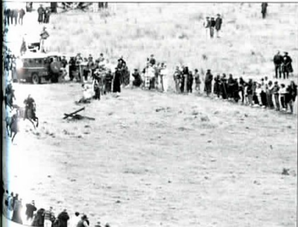
Cattleman's Cup at Castleburn

'And with one clean almighty blow, I'll bring this stockwhip down That's when you'll swing and let 'em go, And head 'em straight for town.'