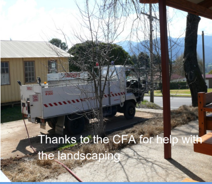
Thanks to the CFA for help with the landscaping