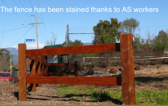
The fence has been stained thanks to AS workers