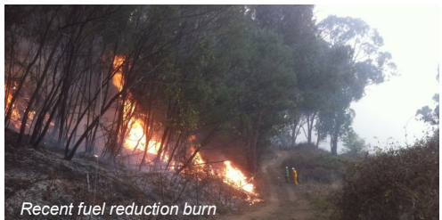
Recent fuel reduction burn

We are sure you are all aware that the Fuel Reduction Burns were successfully completed in our area this year. It was a bit hard not to notice with all the smoke!! It was great to see everyone working together to keep our community safe.