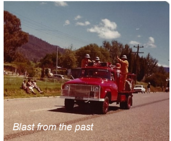
Blast from the past

We must start with the exciting news and announce that our AGL Hydro Community Support Fund Grant Application was SUCCESSFUL. We will finally have safety lighting at our equipment shed making it safer for our members attending call outs after hours. We certainly thank AGL for supporting our Brigade and our community.