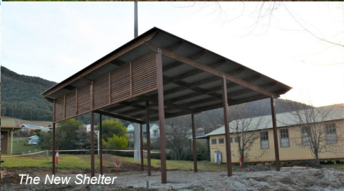
The New Shelter

A Journey down Memory Lane ... let us know if you recognise any of these faces!